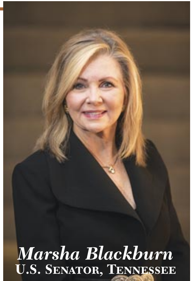
Marsha Blackburn U.S. SENATOR, TENNESSEE

In 2018, Tennesseans voted overwhelmingly to send her to the United States Senate. She is the state's first female Senator.